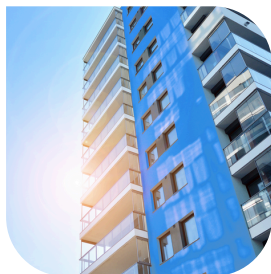
Build to Rent